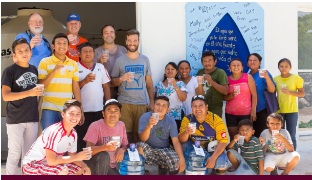
"United in Christ's love, we glorify God through worship, nurture, and service to all people."

Not sure which account to choose? The General Endowment provides support to all ministries within the church and allows the Board the flexibility to use these funds where there is the greatest need.