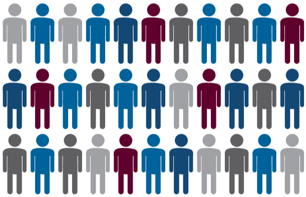
33 Unity Donors